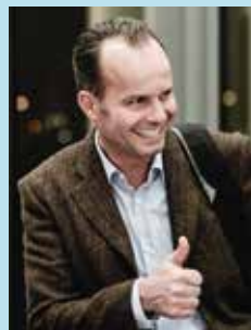
Prof. Günter Huhle

Project start: 01/2018 Project end: 12/2018 Total EU funding: € 0.5 million Funding for NRW: € 0.3 million