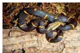
Viper Azemiops feae

Syneuro Ltd. (associated with the Shemyakin-Ovchinnikov Institute of Bioorganic Chemistry, RAS, Moscow) is recognised worldwide for the isolation of new peptides and proteins from snake and other animal venoms. The gold standard for the analysis of toxin-receptor interactions is electrophysiology, but current approaches must be miniaturised for very small amounts of natural toxins.