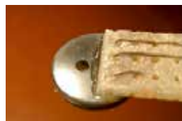
Electrophysiological mini-chamber (prototype)